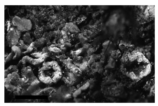
Fig. 3. Psoroma absconditum (holotype). Scale=2 mm.

to 2 (–4) mm diam., almost flat, with thin, rugose thalline margins, concolorous with the thallus; disc slightly concave, deep brown. Cephalodia small, compressed squamulose with digital outgrowths, bluish brown, with Nostoc , on and between the squamules. Hymenium 120–160 \mu m high, uppermost part yellow-brown. The cortex of the apothecium is pseudoparenchymatous, with thin-walled cells in the inner part and more thick-walled cells towards the surface, with a few minute hairs. Ascospores 8 per ascus, 13–16 × 9–11 \mu m, with a minutely rugulose surface.